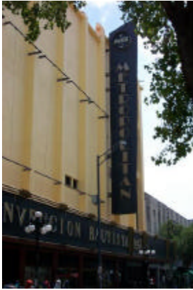
The Convention was held at the Metropolitan Theater in downtown Mexico City.

"I just couldn't imagine the week going any better than it has."