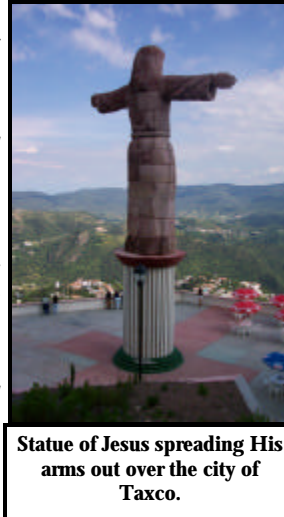
Statue of Jesus spreading His arms out over the city of Taxco.

We have more goals than this for 2004, but hopefully these give you a better idea of what we are trying to accomplish this year.