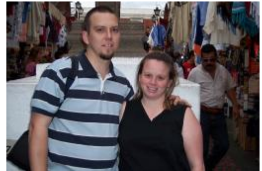
We went to Puebla, Mexico, in March to share at First Baptist Church and promote the seminary program.

Ministry opportunities in other parts of Latin America.